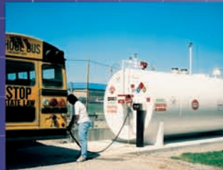
Fuel Dispensing Configurations to meet Your Requirements