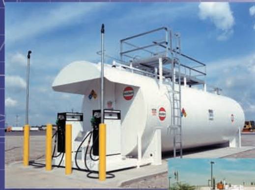
Dispensing Diesel Fuel With 20,000 Gallon Fireguard Tank

The Professionals... Modern Welding Company The Smart Fueling Choice.