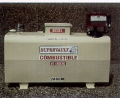
SuperVault MH tanks are available in rectangular and Cylindrical styles.